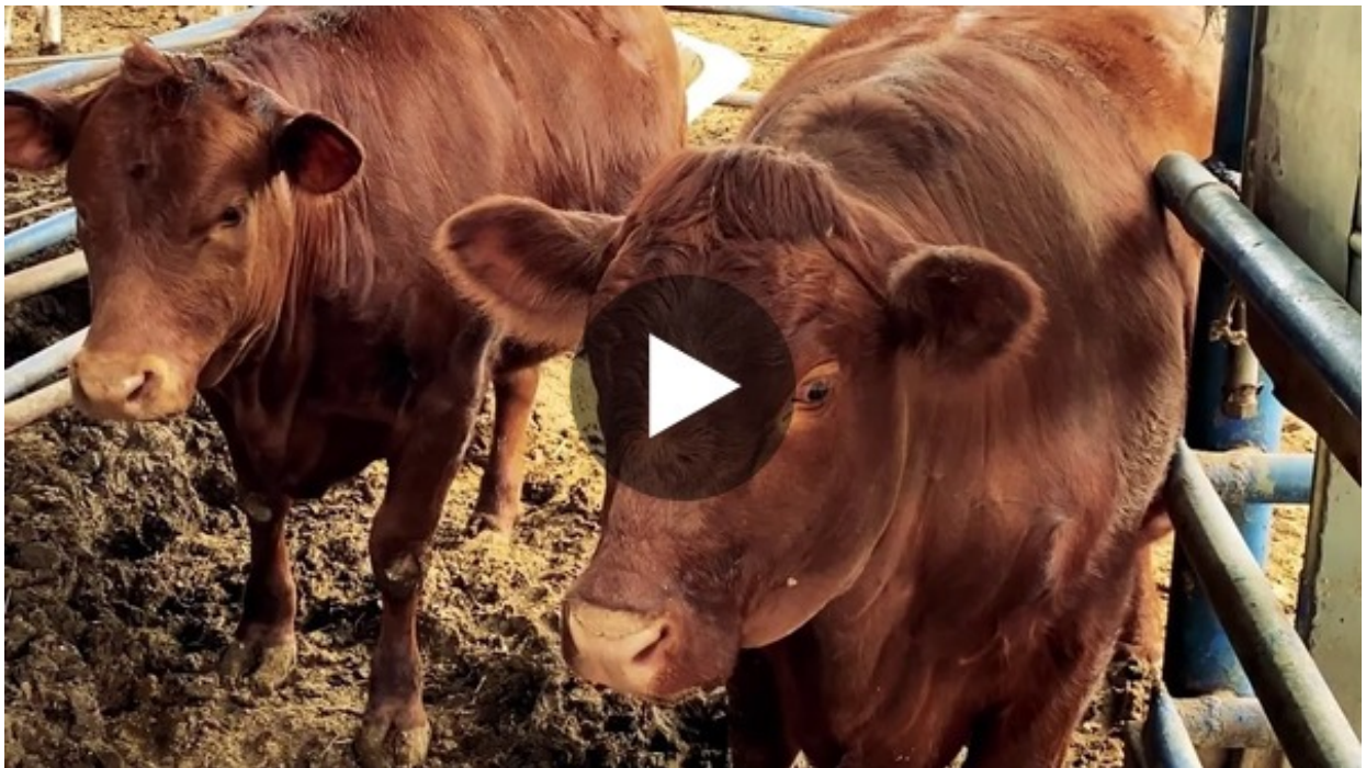
Red Heifer Update March 1 2021

Finally, there have been concerted efforts for decades to breed completely blemish-free red heifers. Jewish law, halacha , requires that red heifers cannot have worn a yoke or had a calf, must have no physical defects or blemishes, and they can have no more than two hairs that are not red. According to the Mishnah, the heifer must also be at least three years old [4]. As of 2021, the Temple Institute did not yet have a perfect heifer, but they were monitoring multiple candidates to see if they would eventually meet all the requirements of Jewish law. They have even conducted a practice red heifer sacrifice to be ready for the real one.