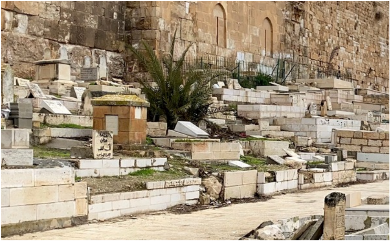
The Golden Gate of the Temple Mount

Foreigners will rebuild your walls, and their kings will serve you. – Isaiah 60:10a