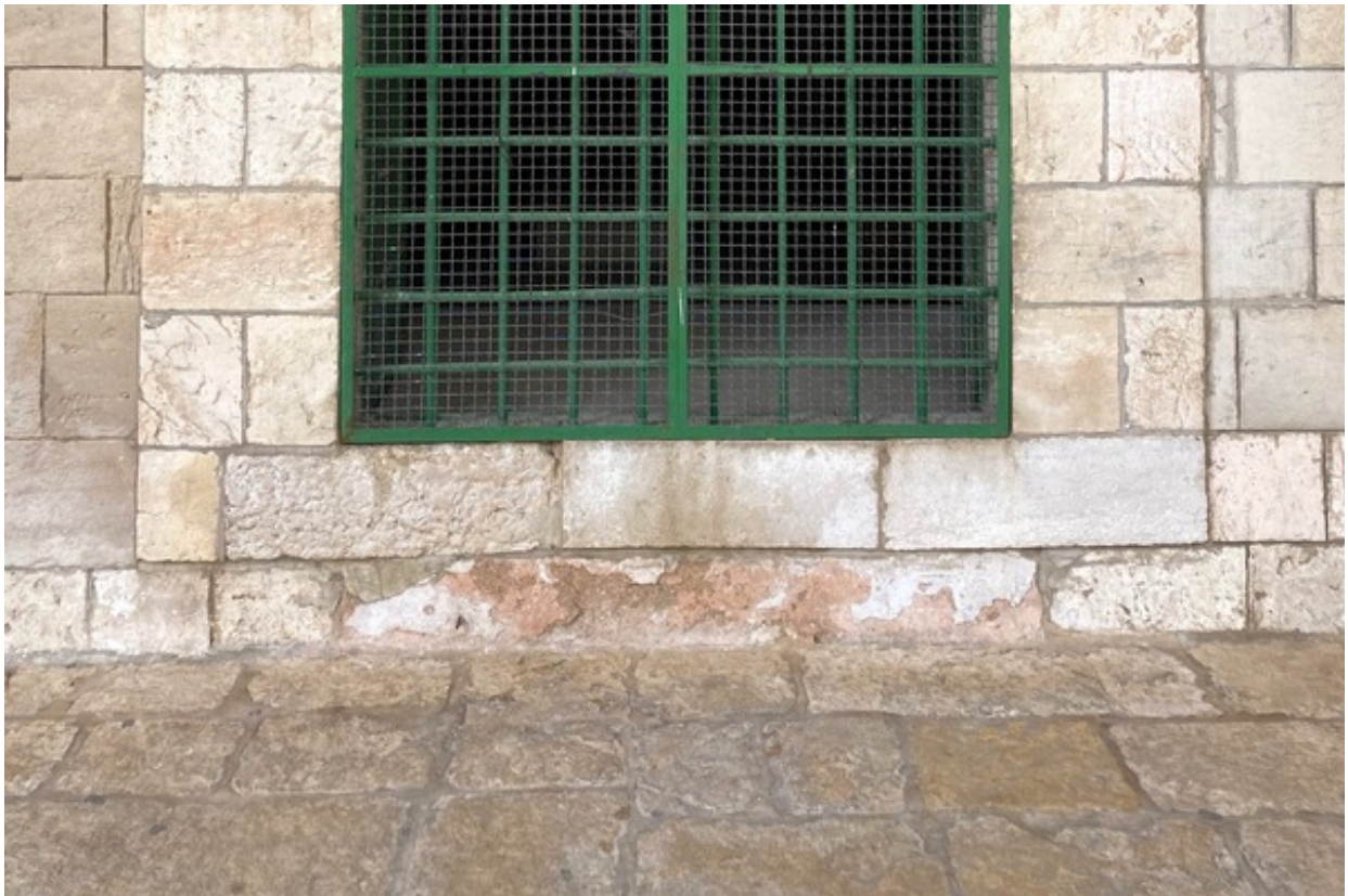
Tomb of Hussein ibn al-Hashimi, King of the Hejaz

Some might say that a king could be found buried anywhere if you wait long enough. But of the 15.7 billion acres of land on the earth, few have any kings buried on them, and the 36 acres of the Temple Mount are expressly forbidden to have anyone buried there in the first place. Wikipedia lists 287 different monarchies that have existed around the world since the early Bronze Age. Recognizing that kings are often buried together or in proximity for a given monarchy, we could estimate that all the world's kings from the early Bronze Age until now are entombed in less than 10,000 acres of land. We should also acknowledge that people only inhabit about 10 percent of the land on the planet. Using those numbers, one could estimate that the odds of