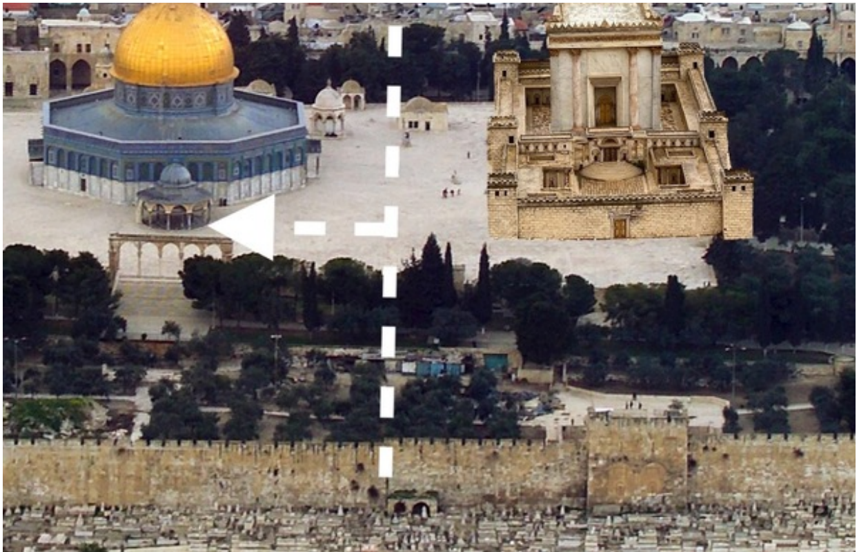
Composite image showing a future rebuilt temple.